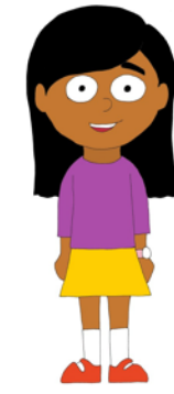
A story about feeling sad and worried