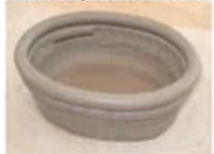
7. Build up layers