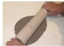
1. Roll out clay