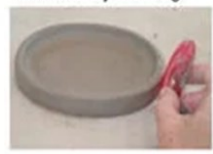
6. Make it smooth with tools