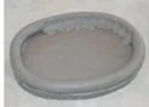
5. Add layers and blend