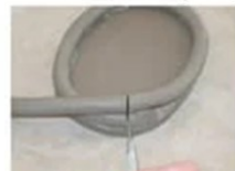
4. Attach by 'scoring'