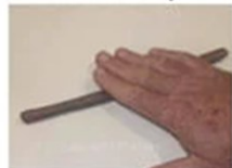
3. Roll out coils